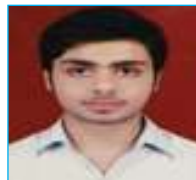
AV Aditya B.B.A-V Globusoft, Genpact